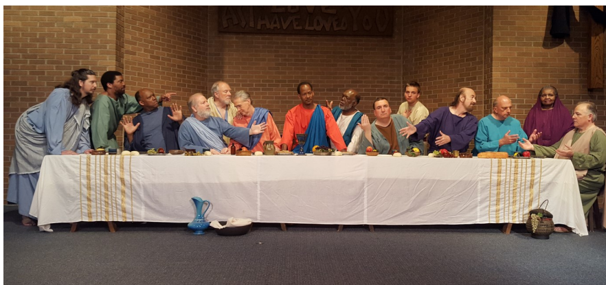
Living Last Supper 2017