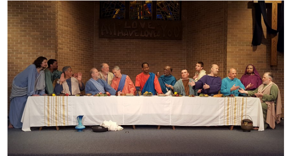
Living Last Supper, 2016

A moving Maundy Thursday service was observed on April 24 with the re-enactment of the Living Last Supper.